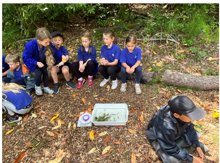
YEAR 2 TRIP TO GATTON PARK