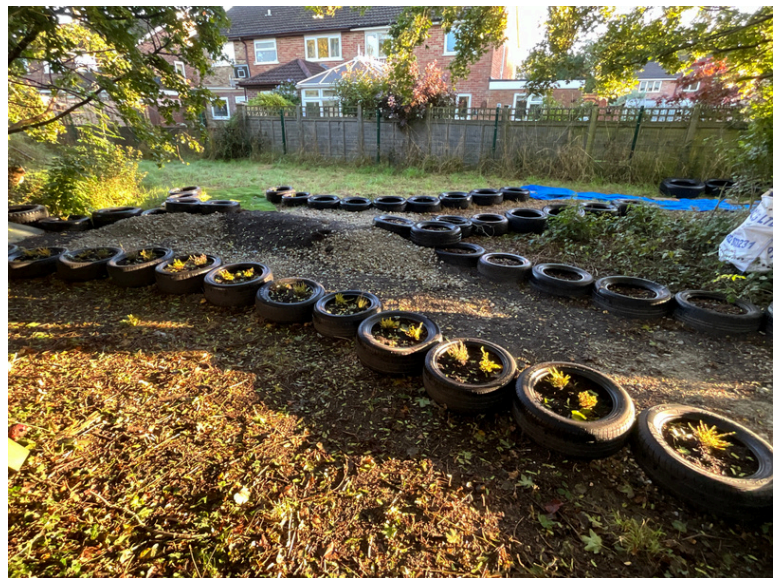
THE BIKE TRACK WHICH IS UNDER CONSTRUCTION